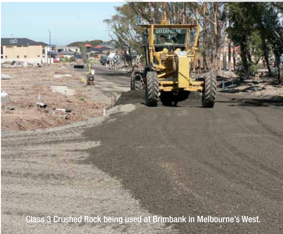
Class 3 Crushed Rock being used at Brimbank in Melbourne's West.

Alex Fraser's Class 2 Crushed Rock is ideal as a base under lightly trafficked roads. Our Class 3 Crushed Rock has greater versatility and can be used for road base in most civil construction applications including road pavements, car parks, slab preparation, pipe bedding and walkways. Alex Fraser's Class 3 Crushed Rock is regularly used on some of Melbourne's largest residential sub-divisions.